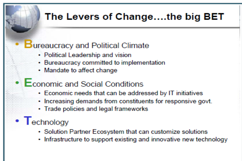
Figure 3: Levers of Change – the big BET