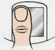
錯誤位置 Wrong position