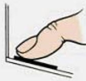
手指屈曲 Bent finger